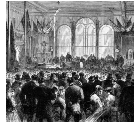
Since our beginnings in the 1800s, textiles has been woven into the fabric of our institution. Our smart materials research is world renowned and our textiles surface design course is a multi-award winner

The University of Bolton traces its history back to the foundation, in 1825, of the Bolton Mechanics' Institute, one of the first to be established in the UK. Throughout its history and in its various incarnations, this institution's primary purpose has been to provide educational opportunities for those who wish to better their situation and their prospects. The University of Bolton continues, in 2014, to offer programmes with a strong vocational, professionally focused, orientation and it has a strong, applied research profile.